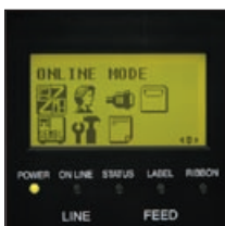
Large LCD display with graphical icons for user-friendly operation