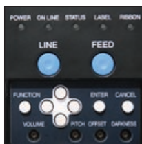
Multifunction buttons providing easy-to-navigate menu options