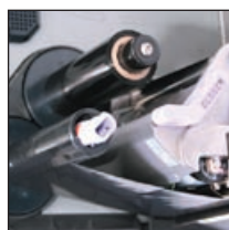
Coreless ribbon simplifying the ribbon setting operations (option)