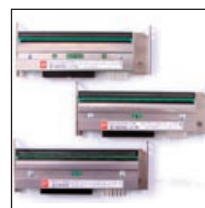
User configurable print head 203/305/609 dpi