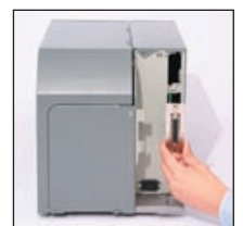
Tri-interface port for various connectivity